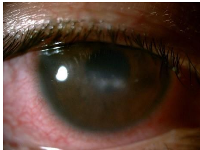
Figure 1: Right eye showed hyperemic conjunctiva

ill-defined margins of approximately 1.4 x 1.8 mm (Figure 2) with an overlying epithelial defect. However, there was no perineural ring infiltrates seen. Anterior chamber examination showed presence of mild anterior chamber inflammation without hypopyon. Intraocular pressure was normal. There was no posterior segment abnormalities. Anterior and posterior segments examination was sound in the fellow eye.