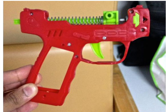
Figure 1: Photograph of the airsoft toy gun which caused the injury

There was history of poor compliance to patching. During his follow-up it was reinforced to the parents regarding the need for patching over the right eye for 2 to 3 hours' day; ideally with an electronic device as a positive reinforcement only during patching.